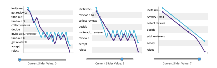
Fig. 6. Results at the levels of abstraction 1, 3, and 7.