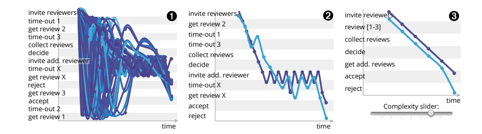
Fig. 1. Three possible ways to display the handling of reviews for a journal from [1] on a CJM: 0 projecting the actual journeys (only the first 100 – out of 10,000 – journeys are displayed); 2 using two representative journeys; and, 3 using two representative journeys and abstracting the activities using the technique presented in this paper.

a journal, a synthetic dataset available in [1]. In the context of this dataset, the service provider is the conference's organizing committee, the customers are the researchers submitting their papers, and a journey describes the handling of the reviews, from the submission until the final decision. In Fig. 1, part ①, it is difficult to apprehend the typical paths of the reviewing process. To this end, representative journeys have been introduced as a means of reducing the complexity. Indeed, the central CJM (②) uses two representative journeys to summarize 10,000 actual journeys. Although representative journeys decrease the complexity by reducing the number of journeys, a CJM might still be difficult to apprehend when it is composed of many activities. Indeed, even though only representative journeys are used, quickly spotting the main differences between the two journeys visible in ② (Fig. 1) is not straightforward due to the high number of activities and the length of the journeys.